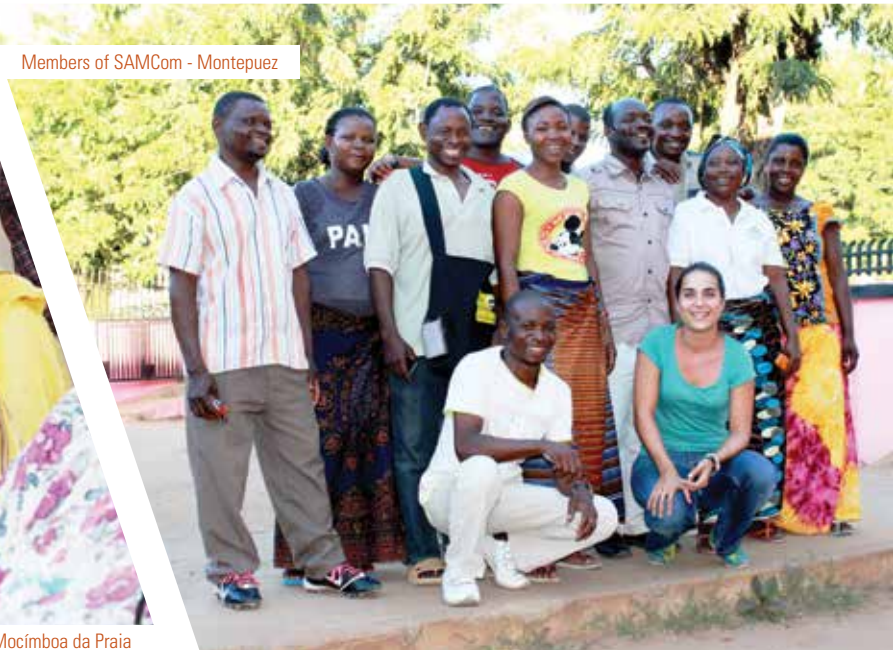
Members of SAMCom - Mocímboa da Praia