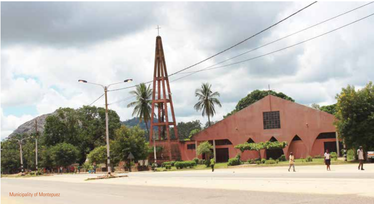
Municipality of Montepuez

Montepuez is a Municipality of category D and is the second most important Municipality of Cabo Delgado. Its population is mainly of Macua origin, with some Maconde and Ungoni. It has about 708.89 inhabitants / km 2 (1997), an approximate area of 79 km 2 and is administratively divided into 17 municipal neighborhoods. Mocímboa da Praia is a Village Municipality located in the district under the same name, on the far North of Cabo Delgado Province. Most of the Mocímboa da Praia's inhabitants belong to the ethnical subgroup of the great Swahili family, called Mwani (People of the Sea), as a result of remote socio-cultural and historic relationships with Arab-Swahili peoples. It has around 40,863 inhabitants (1997), an area of approximately 24,000 km 2 and is administratively divided in 11 neighborhoods.