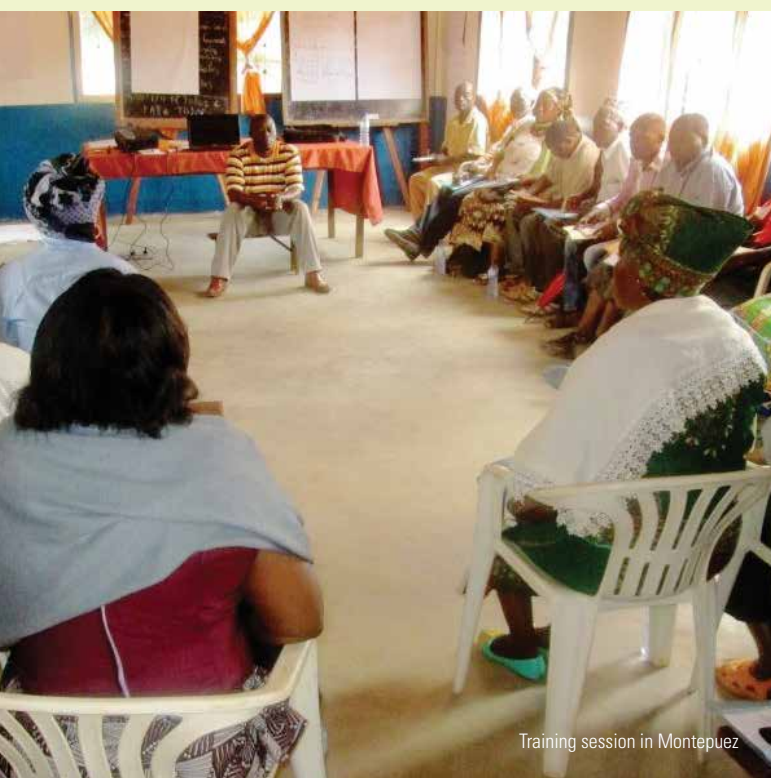
Training session in Montepuez

Currently, it is possible to claim that many changes took place in engagement between Municipal Bodies and municipal citizens (represented by SAMComs) within this process, result of the growing closeness between actors and the drastic decline in distrust that existed among them, which prevented greater collaboration and interaction. Fear, on the part of municipal citizens (SAMComs), to request relevant documents for monitoring of this process, is today practically non-existent and many documents are already provided for the purpose of public consultation. At the same time, the growing interaction between SAMComs and Municipal Assemblies and the training offered to members of Municipal Assemblies made the latter to recognize more and more their supervisory role and acquired new skills to monitor financial statements.