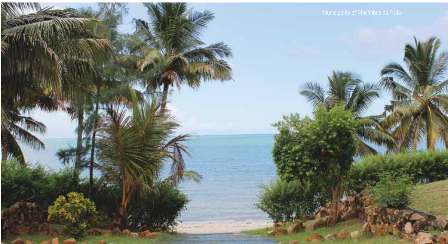
Municipality of Mocimboa da Praia

The Public Integrity Management process should serve to prevent and correct cases of inefficient use of available public resources and the abusive use of public resources (including cases of misconduct, inefficiency, mismanagement, corruption and conflicts of interest). Part of the focus of this process is on the existence of codes of conduct and disciplinary rules and on the observance of their commandments. In addition to it, the process requires continual involvement between the stakeholders (demand and supply) as regards monitoring of misconduct and exercise of corrective actions. It also requires continuous involvement as regards the monitoring of implementation of mechanisms of prevention conceived to limit the scope of the conflicts of interest and corruption at Municipal level. These include records of statement of private interests by senior managers and officials of the Municipal Council and members of Municipal Assembly. They also include transparent and effective implementation of the procurement / tender processes (including submission of statements of interest by bidders).