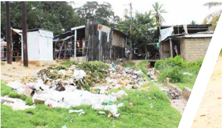
Waste accumulated in some neighborhoods of Mocimboa da Praia