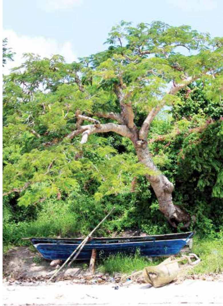
Municipality of Mocímboa da Praia

Initiatives like MuniSAM are indispensable to the sustainable development of Municipalities in Mozambique. Throughout the world, there is a growing recognition of the intervention of citizens in the management of public resources as an important tool for improving governance, transparency, engagement between demand and supply side. On the other hand, the importance of Municipalization for good governance is in general recognized as this brings together public services and citizens. Engagement in itself does not constitute the ultimate goal that is to be achieved, but it is, in similar manner, a viable solution, perhaps the most appropriate and fair, so that all efforts made with public funds can be translated into public services that respond to the most pressing needs and wishes of citizens, in general, and municipal citizens in special. This type of initiatives is therefore, crucial for introduction of greater and stronger demand for Social Accountability in the municipal life in Mozambique. Without a strong and informed demand, by civic groups and other interested actors, for justifications, explanations and corrective measures, the perspectives of a Social and Responsible Accountability are going to reduce drastically.