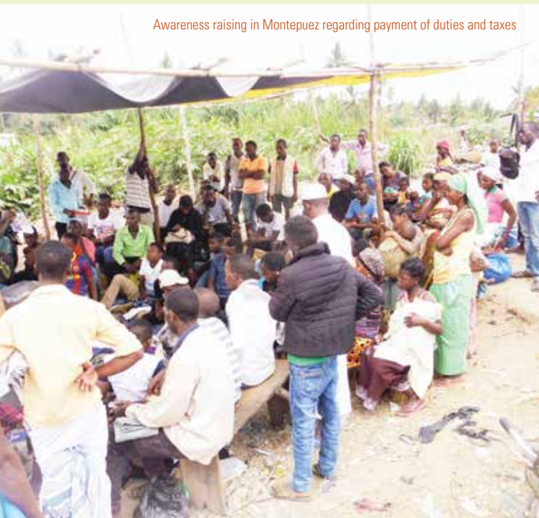
Awareness raising in Montepuez regarding payment of duties and taxes