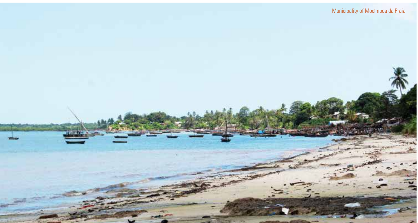
Municipality of Mocímboa da Praia