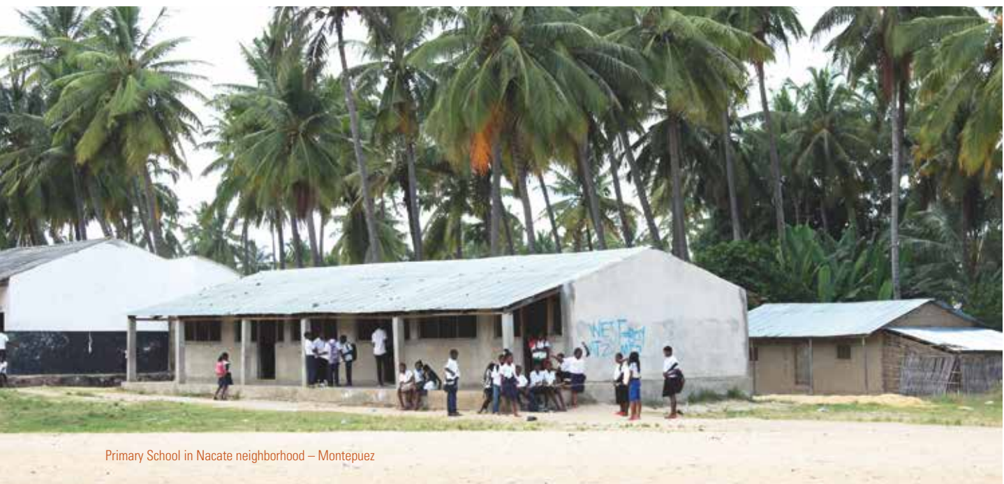
Primary School in Nacate neighborhood – Montepuez

(Vítor Zacarias - Chairperson of Municipal Assembly of Mocímboa da Praia)