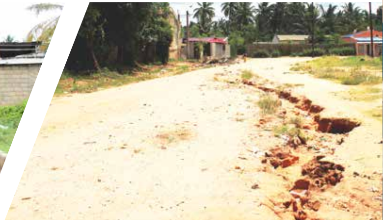
Erosion situation in some neighborhoods of Montepuez