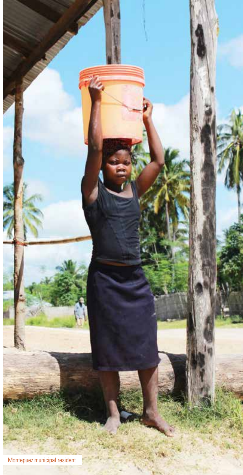
Montepuez municipal resident